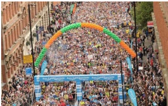
Photo of Manchester 10K

We will meet the cost of the place on the 10K, and we will send you a Sponsor Pack including a DAST T-shirt. All we ask is that you make your own way to and from Manchester and raise at least £100 in sponsorship.